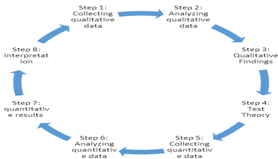
Fig. 2. Exploratory Approach to the Research Process (Creswell (20), 2005)

questionnaires, a total of 22 questionnaires were collected and the work continued into the second stage with these 22 questionnaires to analyze the results. As mentioned above, the initial research model was based on Garavan, Hogan and Donnell's model [18] (2007). This model is only a presentation of the concepts related to the adequacy of training and does not have the required power to develop a theory. Therefore, it is attempted to introduce the conceptual model presented with the help of exploratory studies, in-depth interviews and panel formation and, in this way, identify and count the components related to each dimension and implement the designed model in Social Security health centers. Therefore, the nurses at Imam Reza Hospital were selected as the statistical population to complete the questionnaires and a simple random sampling method was used for sampling. In this study, the ethical considerations, including full assurance of confidentiality of information and freedom of participation in interview sessions or leaving them, as well as the optional completion of questionnaires at each stage of the research were taken into account.