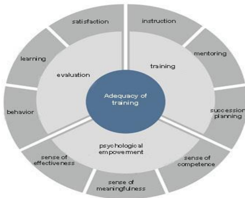
Fig. 1. Conceptual model of the research

more comprehensive picture of training than other models. Therefore, in designing the conceptual model of the research, the structures of the model are based on studying the theoretical foundations and validation thereof by experts according to Phillips model. In addition, the components of the structures have been identified by studying the research literature and conducting in-depth interviews with experts (senior managers, training officials, supervisors and nurses affiliated to the Social Security Organization) as well as two phases of the fuzzy Delphi method.