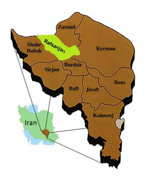
Figure 1: The geographical location of Rafsanjan County in Kerman province of Iran

This descriptive study was carried out in the year 2010 within Rafsanjan County. It should be noted that Rafsanjan County is a county in Kerman province which is located in Southeast of Iran (Figure 1). The county's population based on the 2006 census was 291,417 and the county is famous all over the world for its pistachio cultivation. In the year 2003 Rafsanjan was the largest producer of pistachio in Kerman province with 38151pistachio producers and sharing 43.7% of all pistachio production [12].