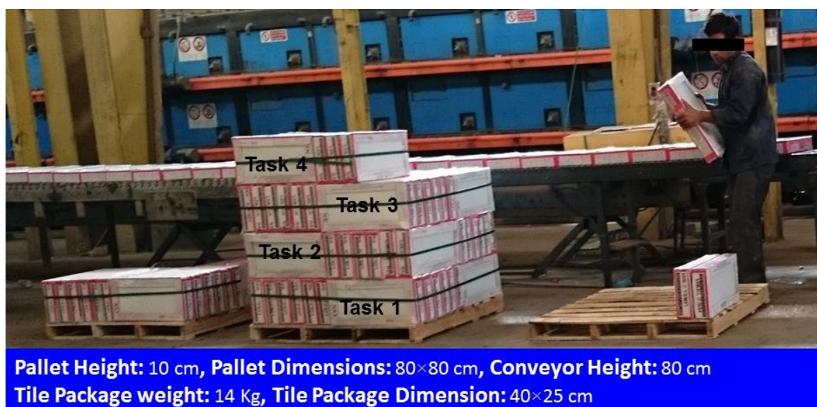
Figure 1: Loading tile packages, from conveyor to pallet

This cross-sectional study was carried out in a tile and ceramic industrial unit in Tehran, Iran, in 2016. All the employed workers were enrolled in this study by census (30 workers). All workers consented to participate in this study. The criteria for inclusion in the study included the work experience less than one year, as well as lack of a history of spinal surgery and traumatic orthopedic problems such as acute back and nerve problems, inflammatory diseases such as ankylosing spondylitis involving the spine, and congenital diseases such as scoliosis and hemivertebra; due to the mentioned factors, 5 workers were excluded from the study. To evaluate manual handling risk factors in one production line (packaging unit), the RNLE was used. Moreover, to evaluate prevalence and severity of LBP, body map questionnaire combined with a visual analog scale (VAS) was used, and LBPDI was evaluated by modified version of the ODI questionnaire. In the following, used questionnaires and tools are briefly introduced.