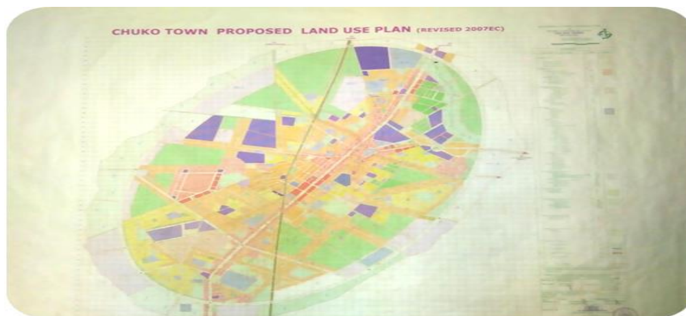
Fig. 1. Chuko Town map

This research was conducted in Sidama Zone, Chuko Town, Southern Ethiopia. SNNPR has 13 zones and 508 special weredas (districts), among which, Sidama extends in a cone-shaped area in the middle of Southern Ethiopia. Sidama Zone borders Arsi Oromo in the north and in the west, Gedeo, Burji, and Guji Oromo in the south, Guji Oromo in the west, as well as Wolayita and Kambatta in the east. It has the geographic coordinates of latitude, North: 5'45" and 6'45", as well as longitude, East, 38' and 39'. Chuko town is located 76 km from Hawassa, the capital of the region. This town has a population of 22,953, including 11,252 males and 11,701 females [17]. This study was conducted during the time period of March 27-April 4, 2009. In this study, a community-based cross-sectional design was utilized.